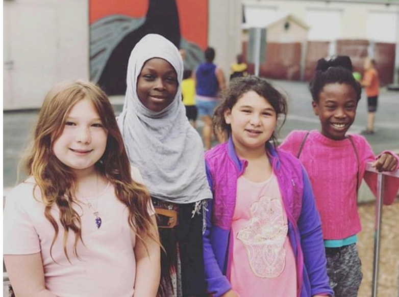
Students from Future Public Charter School